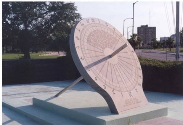
Image: Equatorial Sundial example

An equatorial sundial has a dial plate parallel to the Earth's equator. The gnomon should be perpendicular to the dial plate so it is inclined at an angle equal to the latitude of the observer and points towards true north. The hour lines are spaced at 15 degrees.